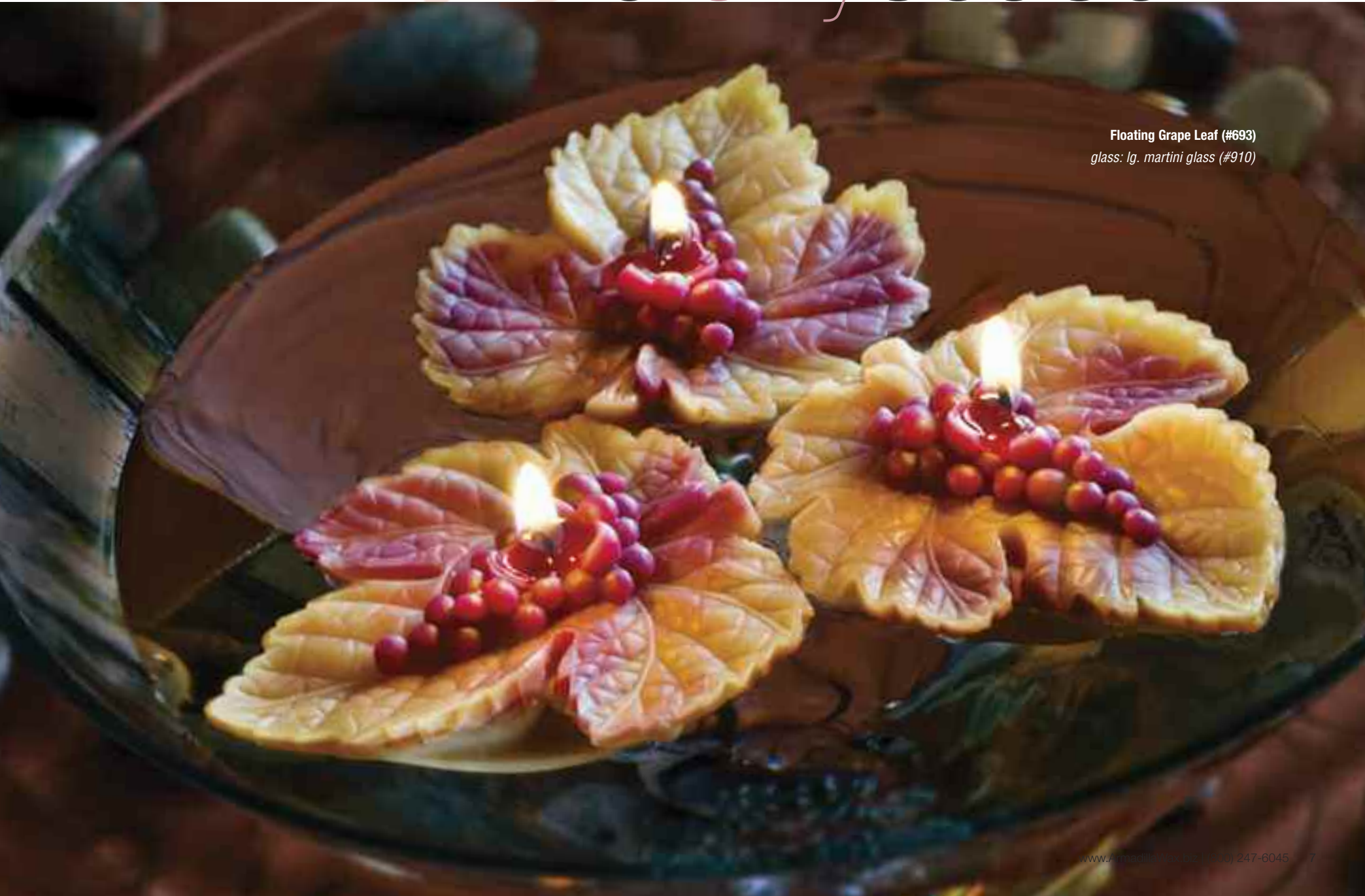
Floating Grape Leaf (#693) glass: lg. martini glass (#910)