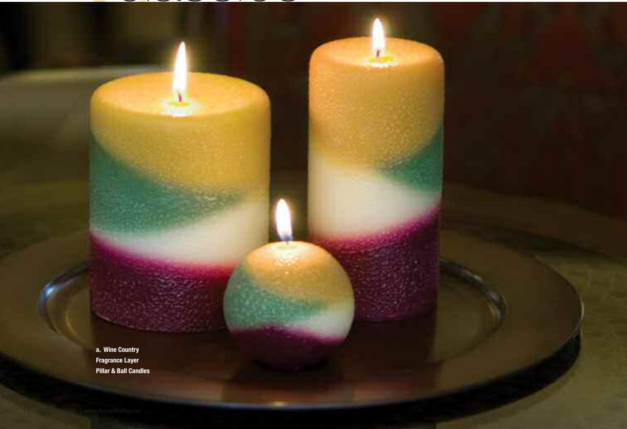
a. Wine Country Fragrance Layer Pillar & Ball Candles