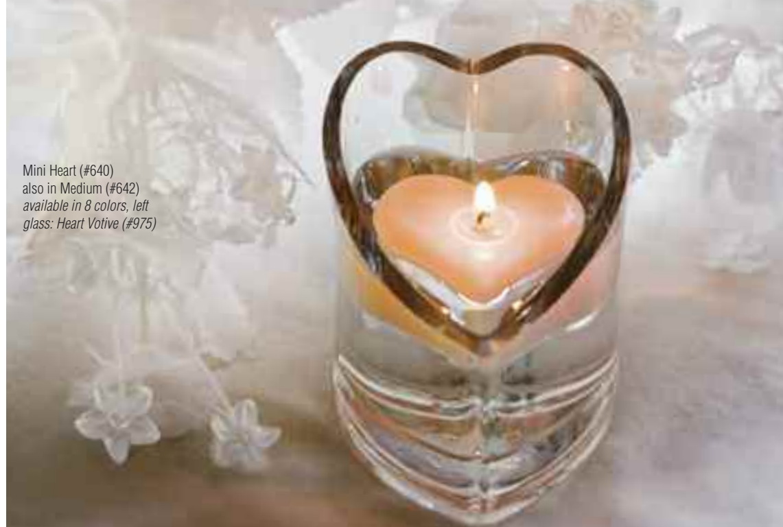
Mini Heart (#640) also in Medium (#642) available in 8 colors, left glass: Heart Votive (#975)