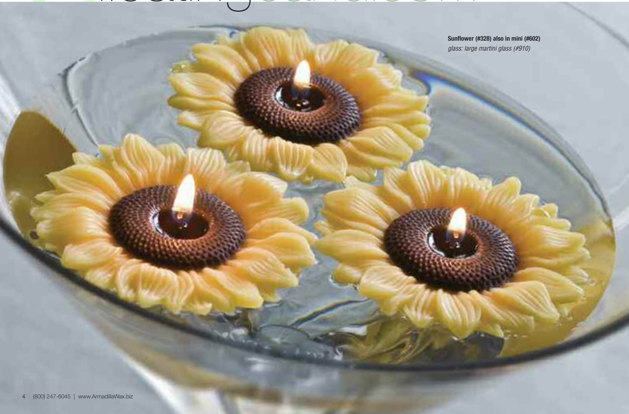
Sunflower (#328) also in mini (#602) glass: large martini glass (#910)