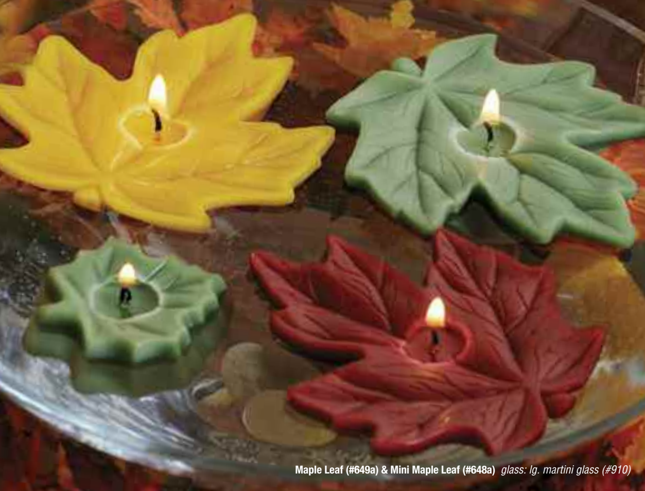
Maple Leaf (#649a) & Mini Maple Leaf (#648a) glass: lg. martini glass (#910)

THE COLORS OF AUTUMN are splendid any time of year. Mix and match our fall leaves with roses or daffodils, or try the pumpkins in April for a Cinderella-themed sweet sixteen birthday party. Use this catalog as your inspiration for creative candlelight ideas to personalize and transform a simple event with flair.