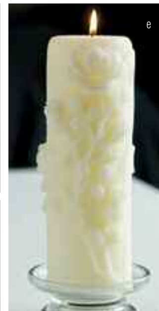
e. Sculpted Rose Unity Pillar (#750) sold separately, or with matching sculpted tapers (#751) available in 6 colors, below