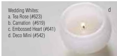
Wedding Whites: a. Tea Rose (#623) b. Carnation (#619) c. Embossed Heart (#641) d. Deco Mini (#542)